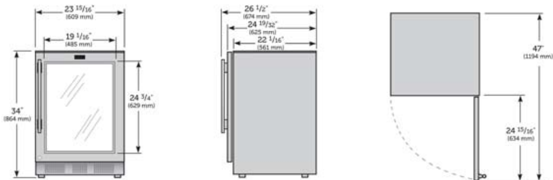
Height Dimensions +/- 1/2"

2001 East Terra Lane, O'Fallon, MO 63366 USA